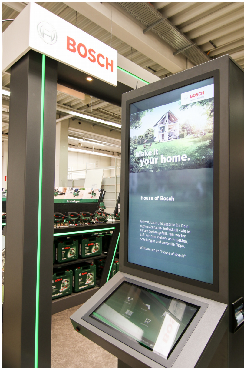
Interactive terminal of the Bosch Experience Zone