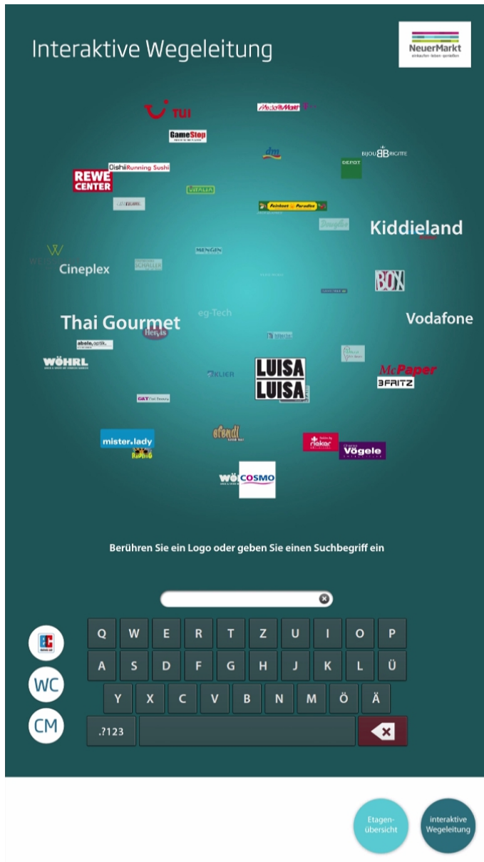
Intuitive logo cloud from kompas wayfinding

touchscreen. kompas wayfinding documents all the users' actions and search requests anonymously and thus serves as a permanent survey tool. The heart of this system is the intuitive LogoCloud: