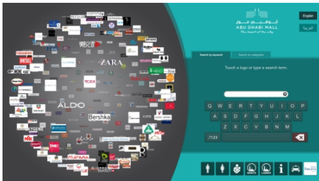
Intuitive logo cloud from kompas wayfinding

kompas wayfinding is an intuitive and intelligent wayfinding system. The interaction with kompas wayfinding takes place via a touchscreen. kompas wayfinding documents all the users' actions and search requests anonymously and thus serves as a permanent survey tool. The heart of this system is the intuitive LogoCloud: