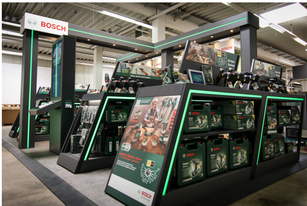
The new feature kompas POS.finder combines interactive Digital Signage with a modern