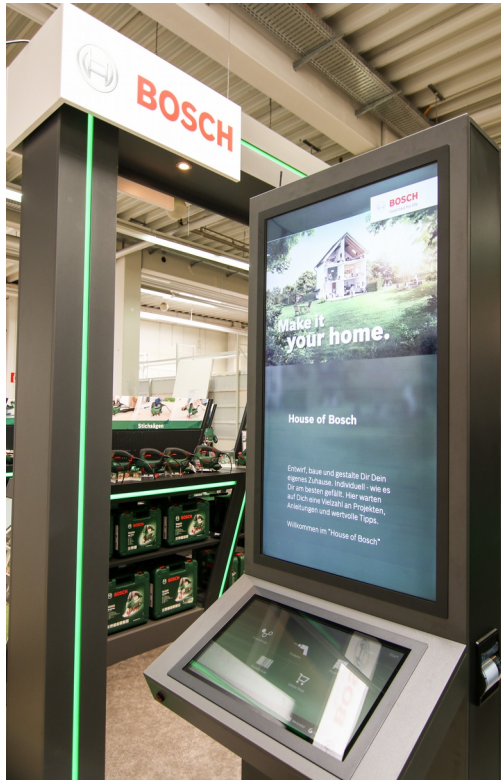
Interactive terminal of the Bosch Experience Zone

to create favorites lists and to scan products directly at the information terminal.