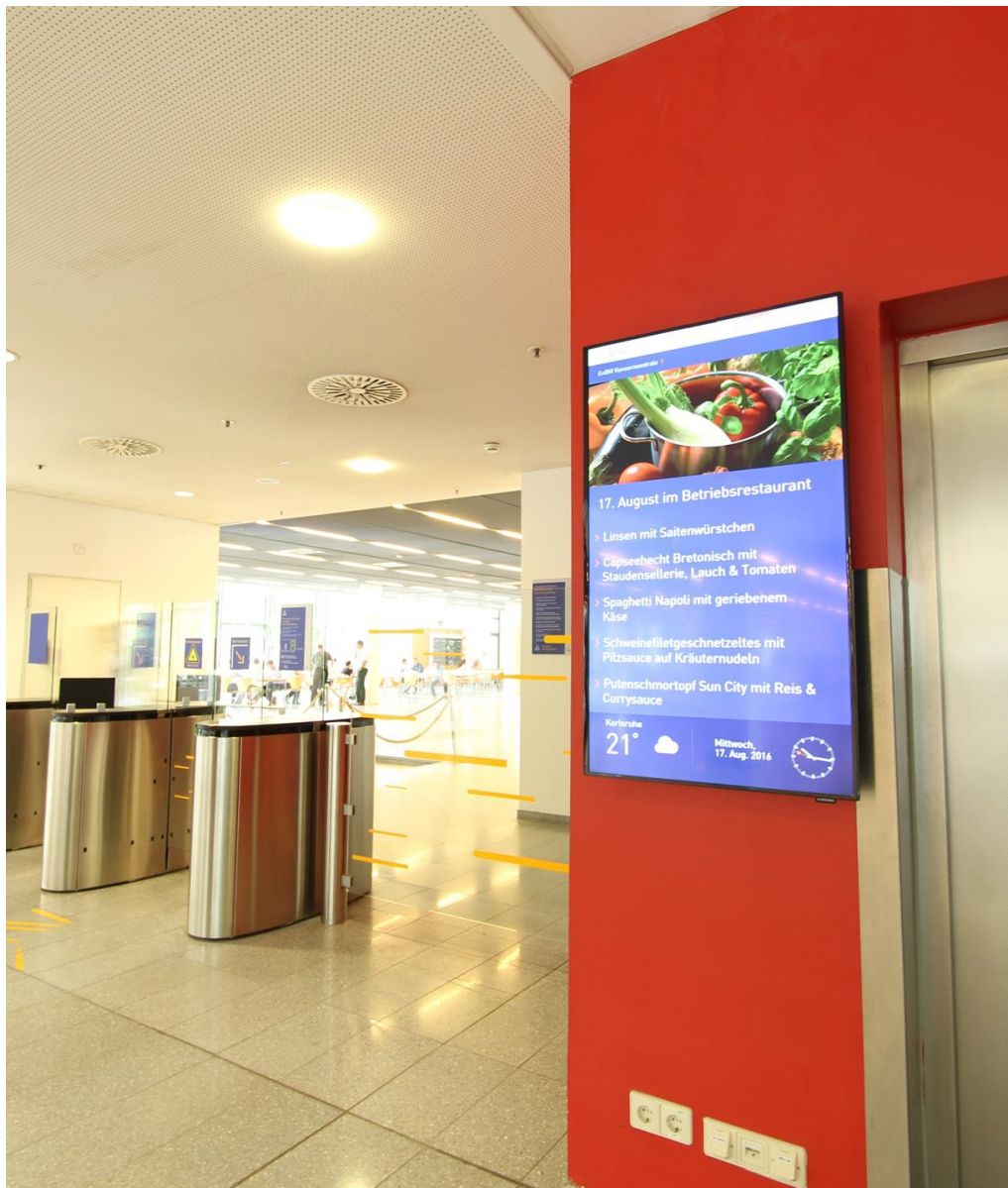
New form of staff communication at EnBW: Digital signage

Markus Mußnug, project manager for internal media at EnBW: “We decided to use digital signage in order to be able to communicate with those members of staff at our various locations who do not have constant access to the intranet. Furthermore, the new communication channel helps us increase awareness of issues relevant to the company. To control the large network and display different content on the individual players, we chose the kompas digital-signage software from dimedis. We were particularly impressed by the flexibility of the software and its simple use.”