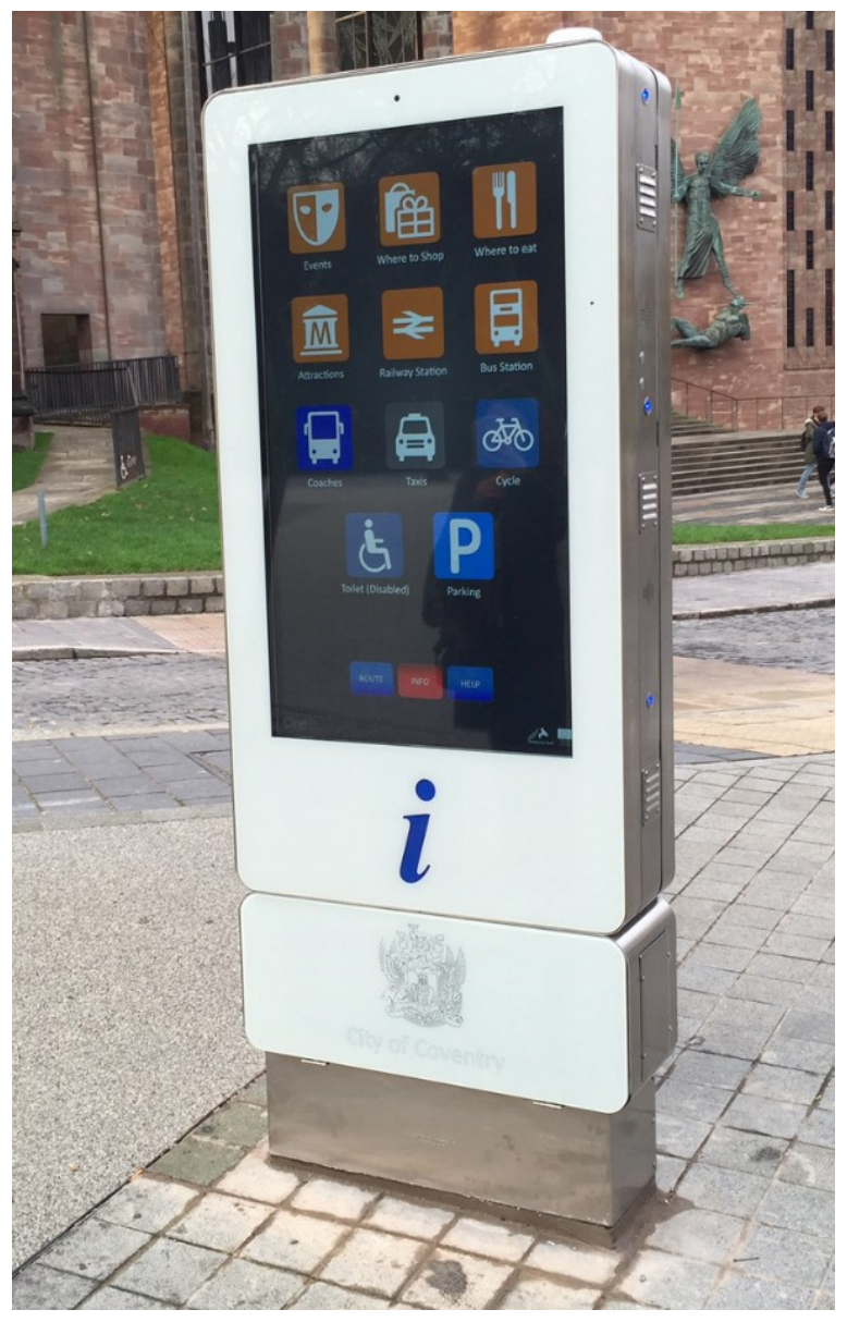
kompas wayfinding in Coventry – digital wayfinding for a modern urban information system

advertising. In Coventry 16 outdoor columns have been installed so far, and more are planned. In Rushmoor six 55"screens have been installed.