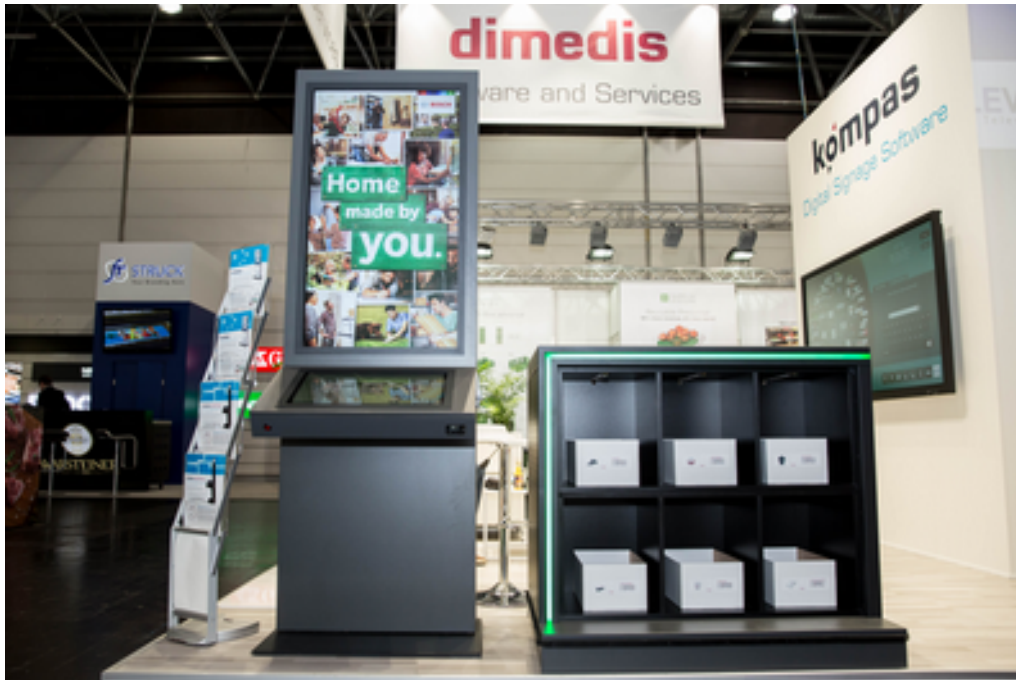
Seamless integration of interactive digital signage and modern product presentation on the shelf