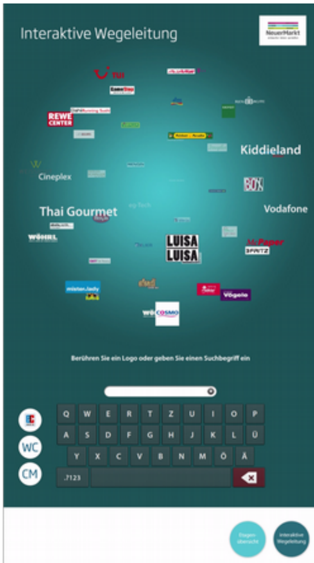
Intuitive logo cloud from kompas wayfinding