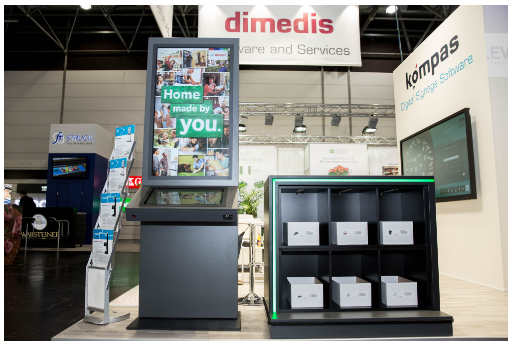
Seamless integration of interactive digital signage and modern product presentation on the shelf

dimedis will be presenting seamless integration of interactive digital signage and modern product presentation on the shelf. If the user selects a product on the column, the product is lit up on the adjacent shelf. The user can now try out the product and put it into his shopping basket straight away. Visitors to EuroCIS can test this function in the Bosch Experience Zone.