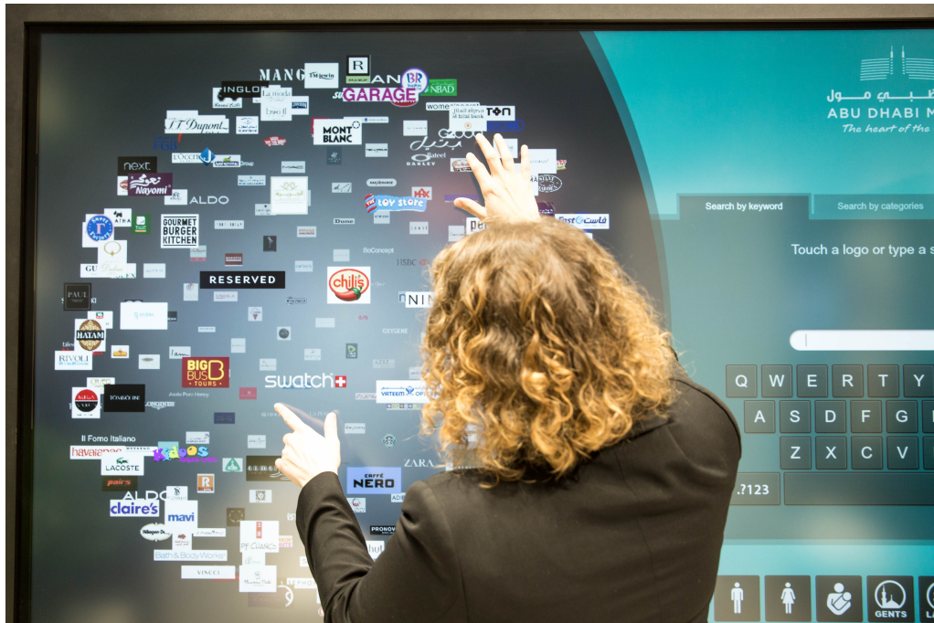
Intuitive logo cloud from kompas wayfinding