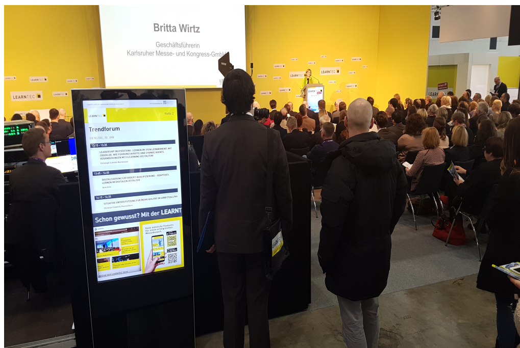
Digital columns at the Learntec

incorporated the trade fair's exhibitor and product portal into the information consoles, a FairMate module. FairMate is an all-in-one solution for visitor management at trade fairs and, like kompas, is provided by dimedis.