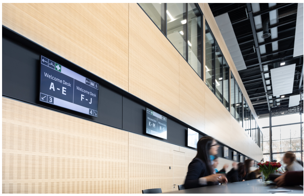
Messe Dortmund with new entrance and even more digital signage

A further expansion of digital wayfinding with kompas is planned for this year.