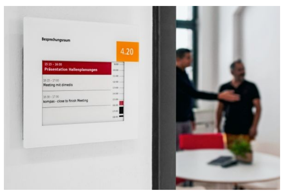
Messe Düsseldorf relies on kompas in order to digitalize the meeting rooms and door signs

Heike Schlott, organization consultant at Messe Düsseldorf talks about the project: "We decided to use kompas digital signage because the software integrates perfectly with our existing booking workflow. The appointments booked via Outlook are now concisely displayed at each room – there was no need to familiarize ourselves with complicated software."