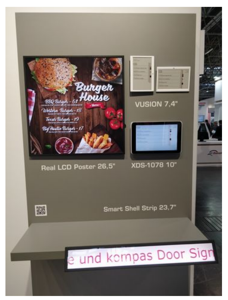
kompas Satellite controls various small screens and e-ink devices that do not have their own mini PC