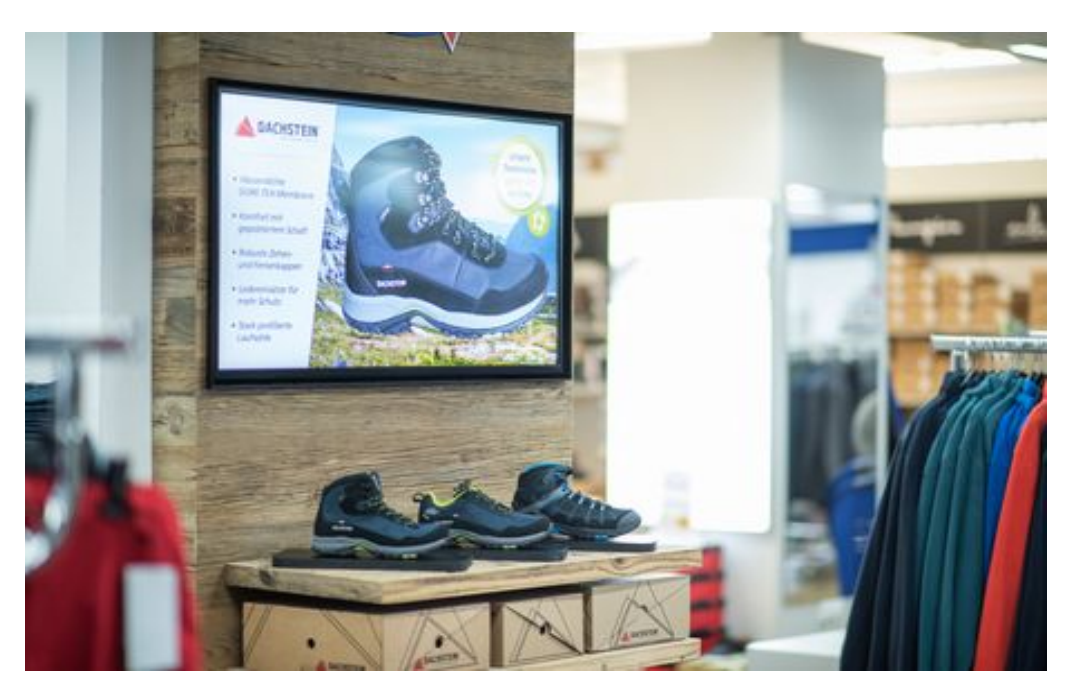
kompas RFID: kompas starts playing the content the moment the customer takes the product off the shelf